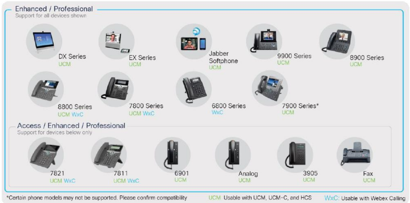
Figure 1. Named User device support