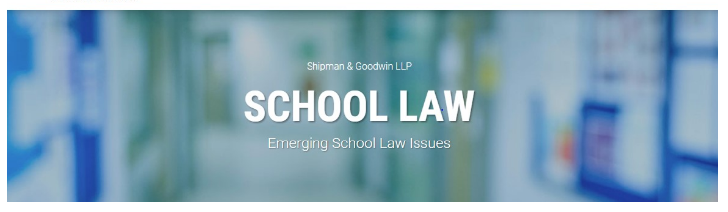
Home ➤ Featured ➤ SEE YOU IN COURT - May 2020